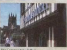
The Commandery, Salford

Halloween fun activities at The Commandery, Tudor House and Greyfriars House & Garden, or enjoy a theatre performance or live music at Huntington Hall. There are lots of things to see and do in Worcester during the Uniquely Worcester campaign from 19th October to 2nd November. Visit www.uniquelyworcester.com for further information about What's On in Worcester.